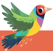
Baby Gouldian finches